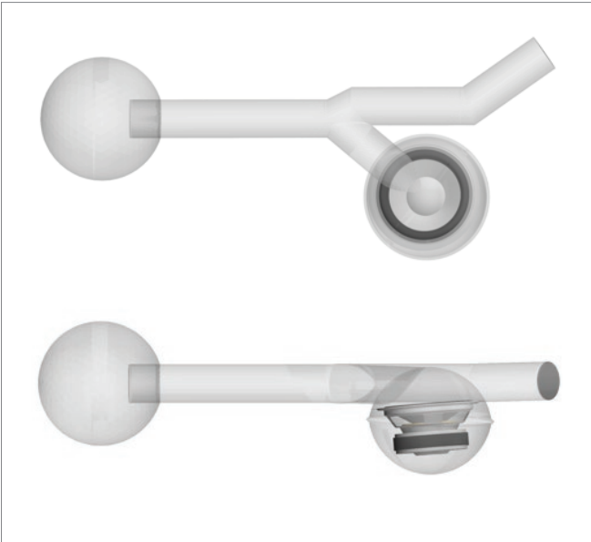
Exhaust line with active noise cancellation system: Top view and side view

Tenneco Inc. is one of the world’s leading designers, manufacturers and distributors of clean air and ride performance products and systems for the automotive, commercial truck and off-highway markets and the aftermarket. Tenneco integrates emissions components and supplies its customers with exhaust systems that support gasoline, gasoline direct injection, flex-fuel and diesel applications. The company has revenue of $8.2 billion, nearly 30,000 employees and more than 90 manufacturing facilities worldwide.